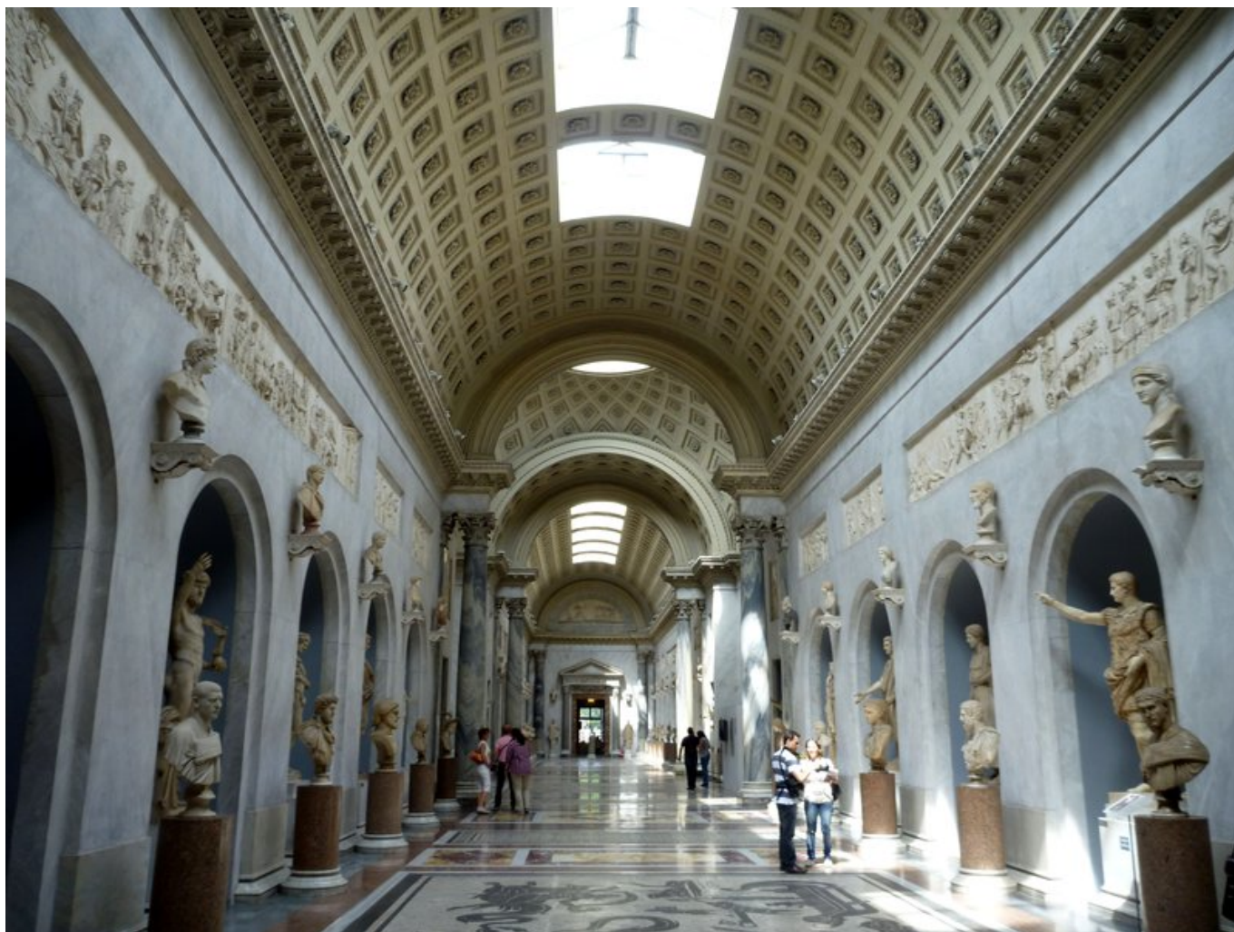
Inside the Vatican

Cardinal Newman recorded for posterity his insight into the way in which the true teaching of Christ was covered over with the paganism of old Rome by the Roman Catholic church. In one of his Tracts for the Times , written in 1883, he declared: