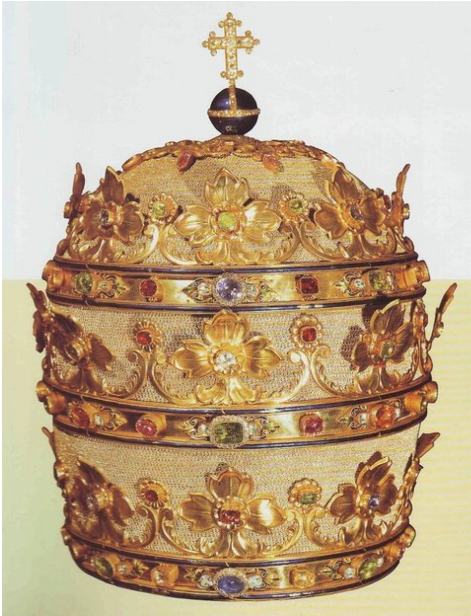
The Pope's tiara – made of cloth of gold and comprises 3 crowns with 232 pearls, 220 diamonds, 32 rubies, 18 emeralds and 11 sapphires.