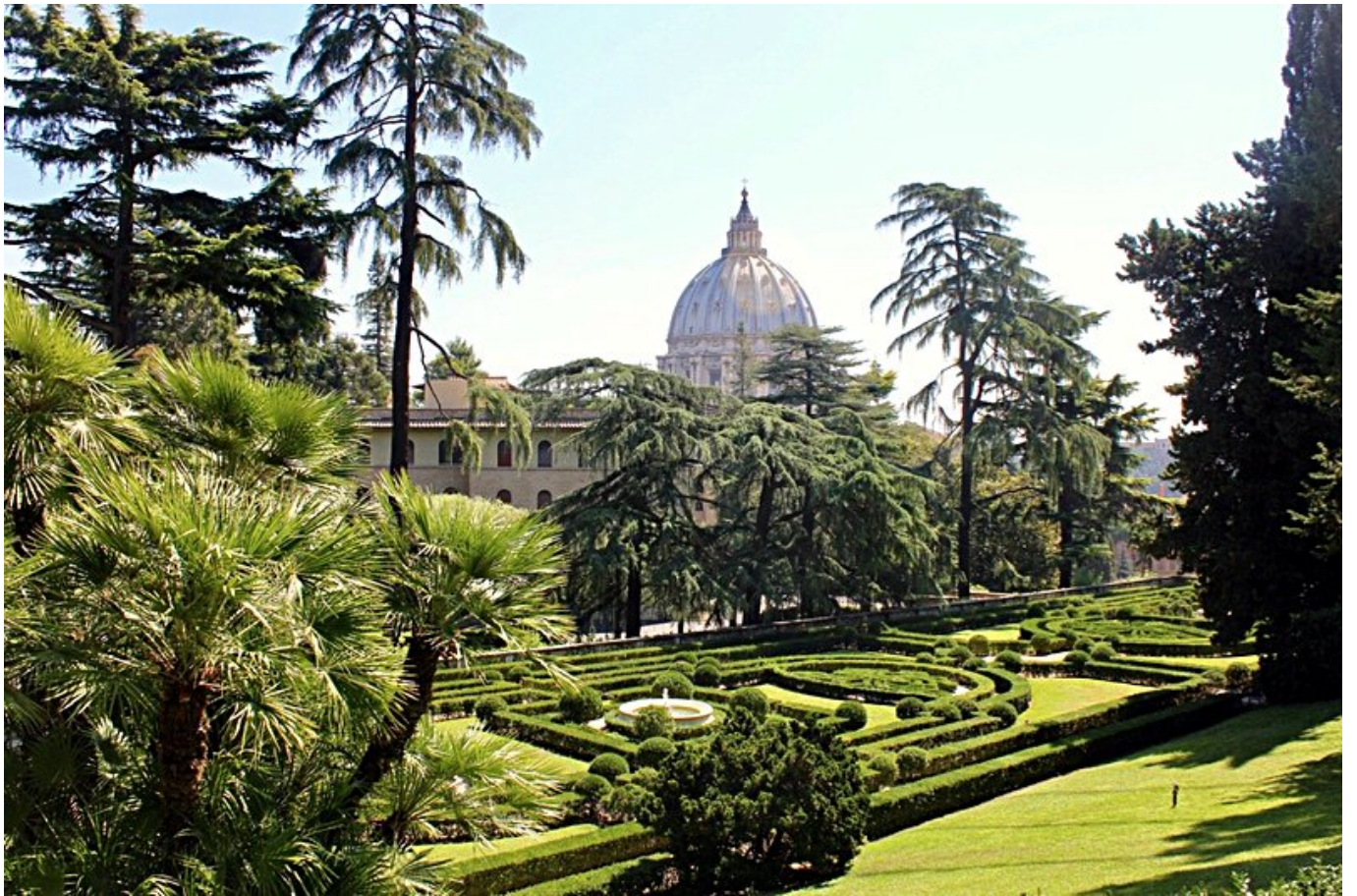
The Pope's gardens in Rome.