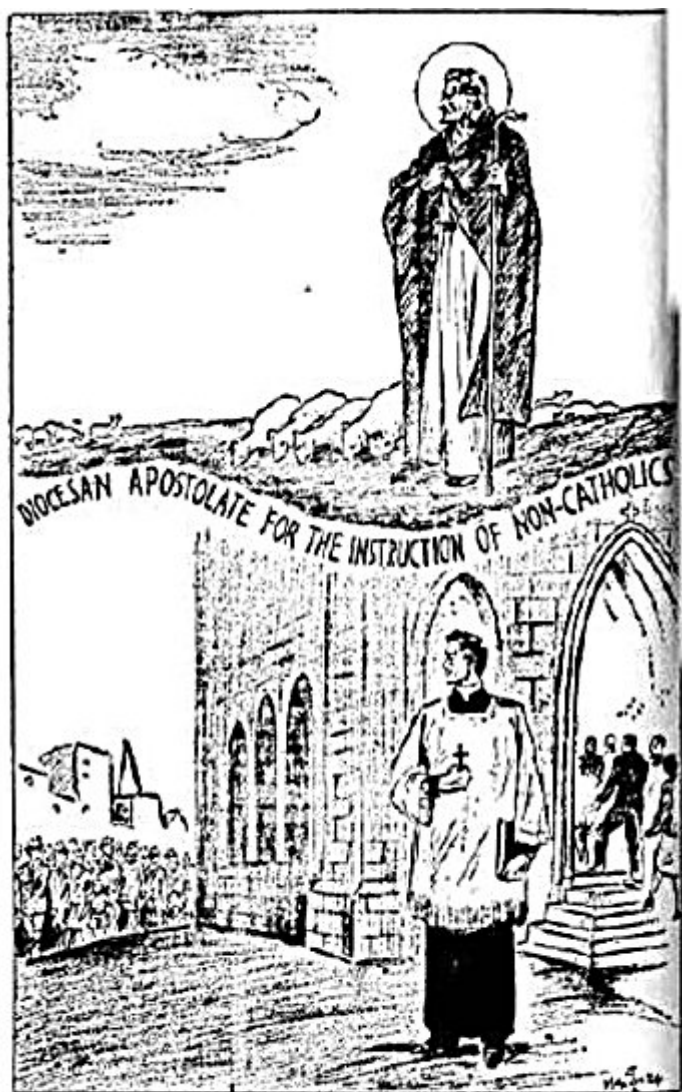
Above picture, from the Catholic Brooklyn Tablet, of November 3, 1913, falsely shows the priest as 'Alter Christus,' 'Another Christ.'

torial power of the church of Rome in both religious and political affairs, as we see it today, will be explained in a second article in next month's issue.) [Included below -Ed]