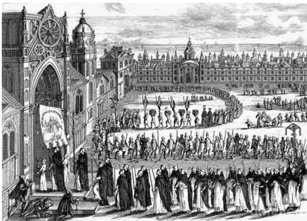
The Inquisition in Goa India.

But like the modern Axis dictators, the church of Rome will find from now on that ruthless persecution of dissent from its reactionary creed is not an effective weapon to subdue the enlightened will of the masses.