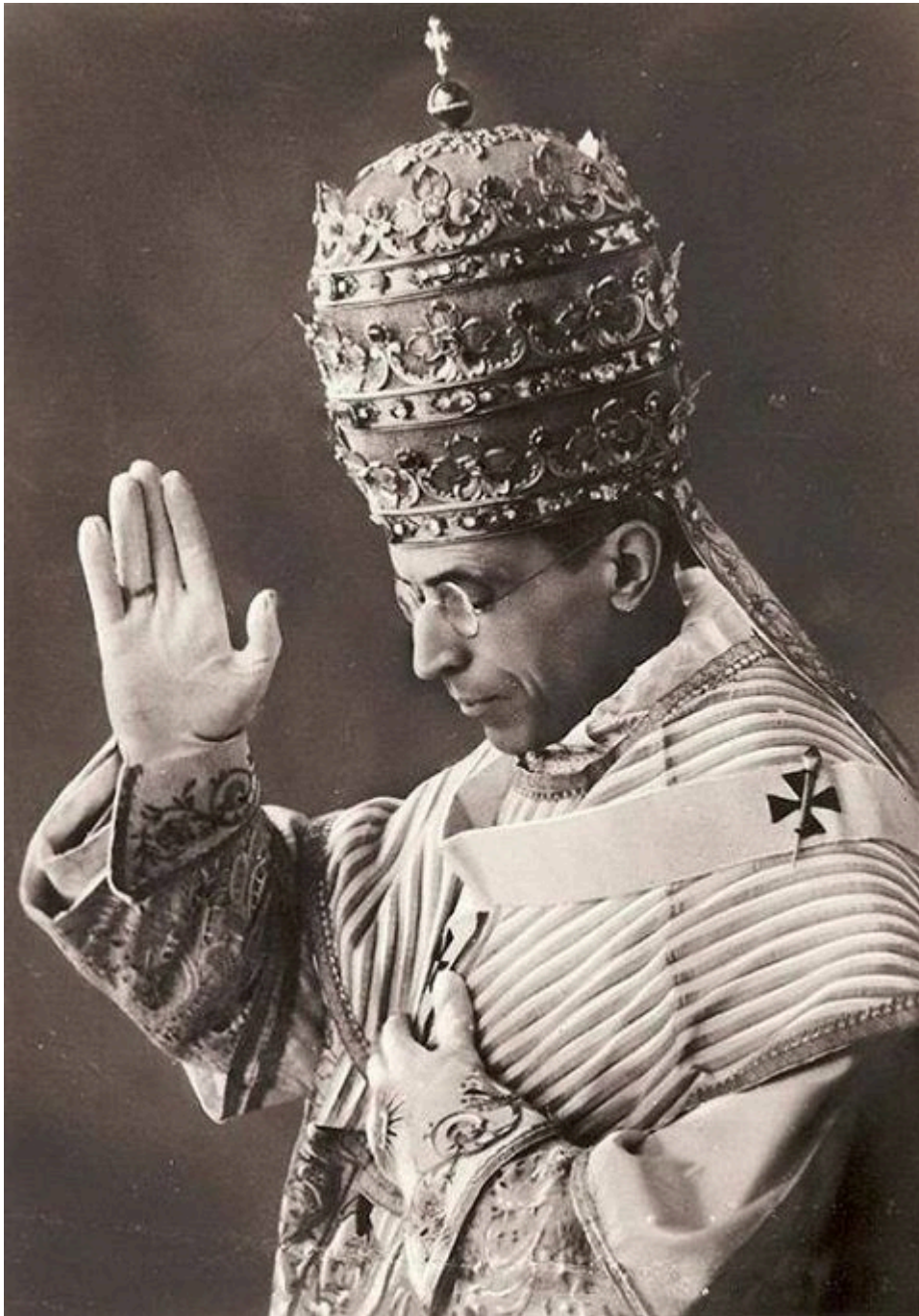
Pope Pius XII, Pontifex Maximus of the Roman Catholic Church wearing his bejeweled tiara or triple crown, symbolizing his claim to be the father of princes and kings, ruler of the world and vicar of Jesus Christ.

Maximus (which he retains to this day) and his college of seventy cardinals. Just as the distinguishing sign of the pagan flamen was a hat, so the distinguishing sign of a Roman cardinal to this day is a hat. The tiara of the pagan high priest of Rome also became the head-dress of the Pope. The lituus of the Roman augurs became the crosier or pastoral staff of the Pope and bishops of the church of Rome. When Julius Caesar became the high priest or Pontifex Maximus , he compelled Pompey to kiss his foot, a custom followed, also by his successors Caligula and Heliogabulus. The Popes also took over the custom.