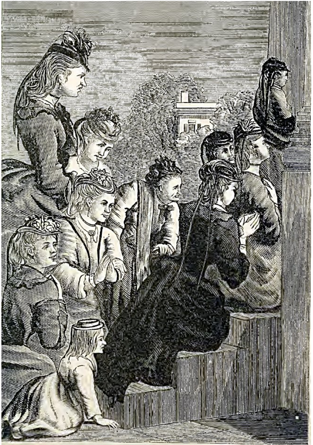
WOMEN CREEPING INTO CHURCH.