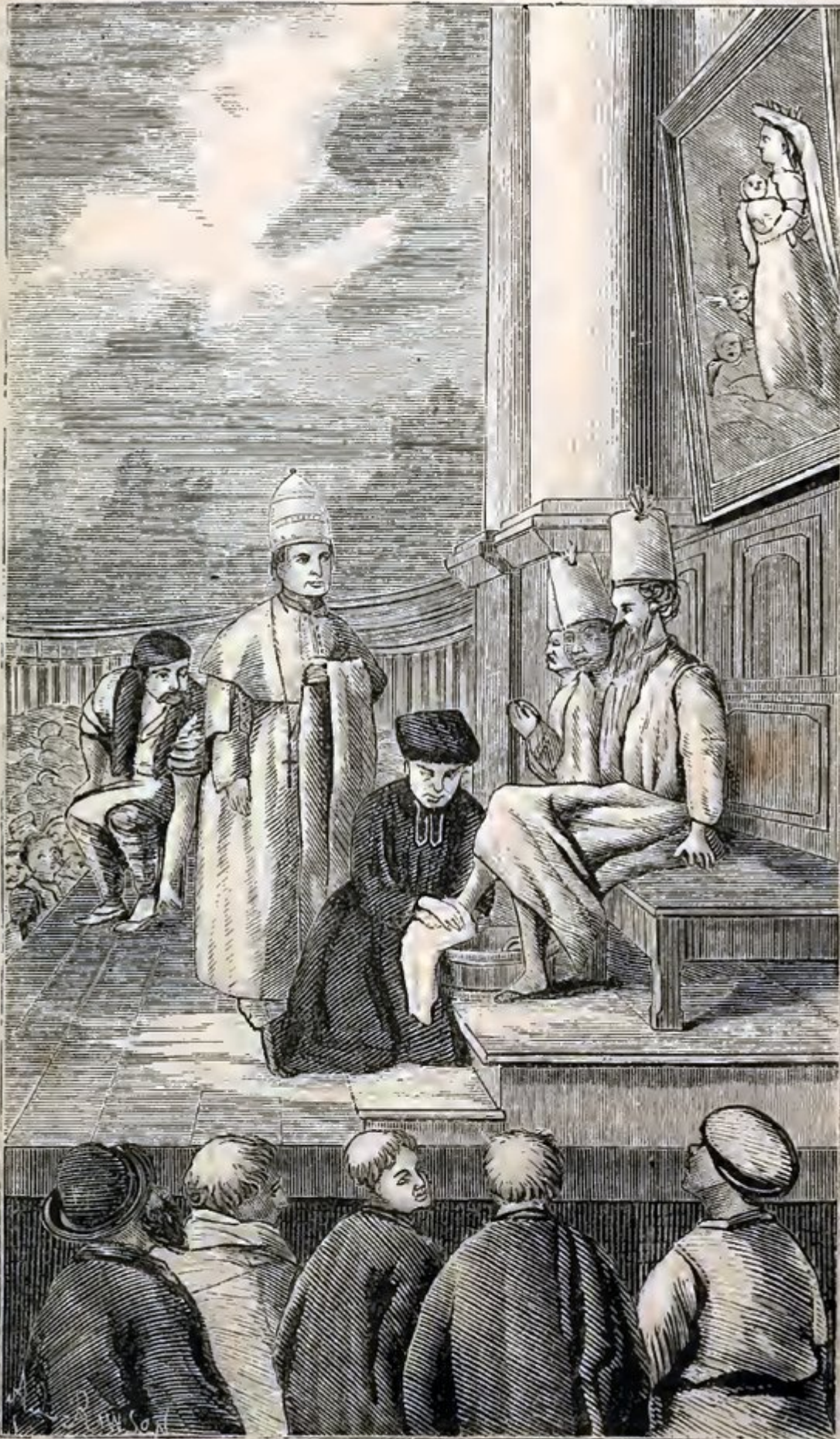
THE CEREMONY OF WASHING FEET.