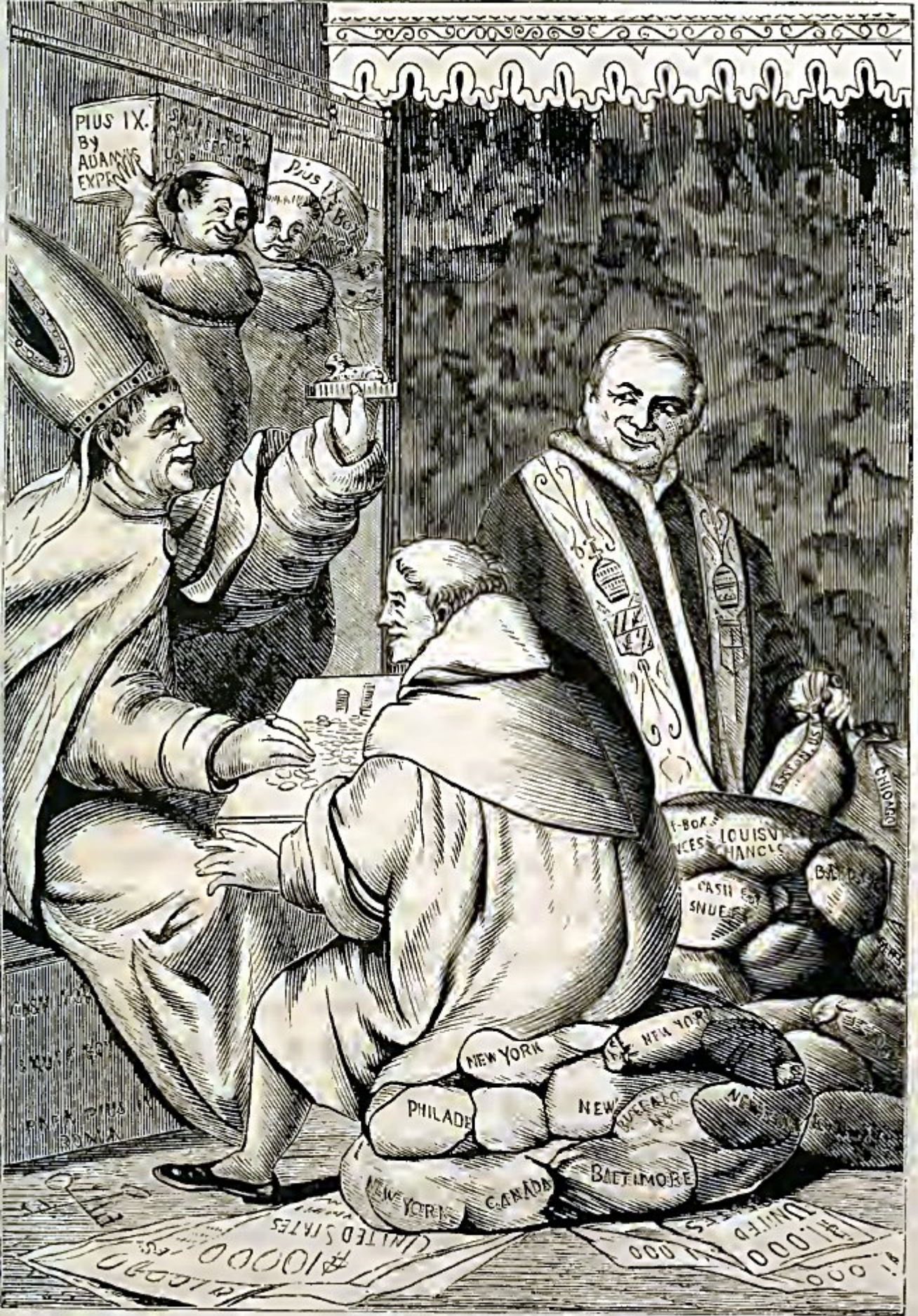
DRAWING THE CHANCES FOR THE SNUFF-BOX OF PIUS IX.