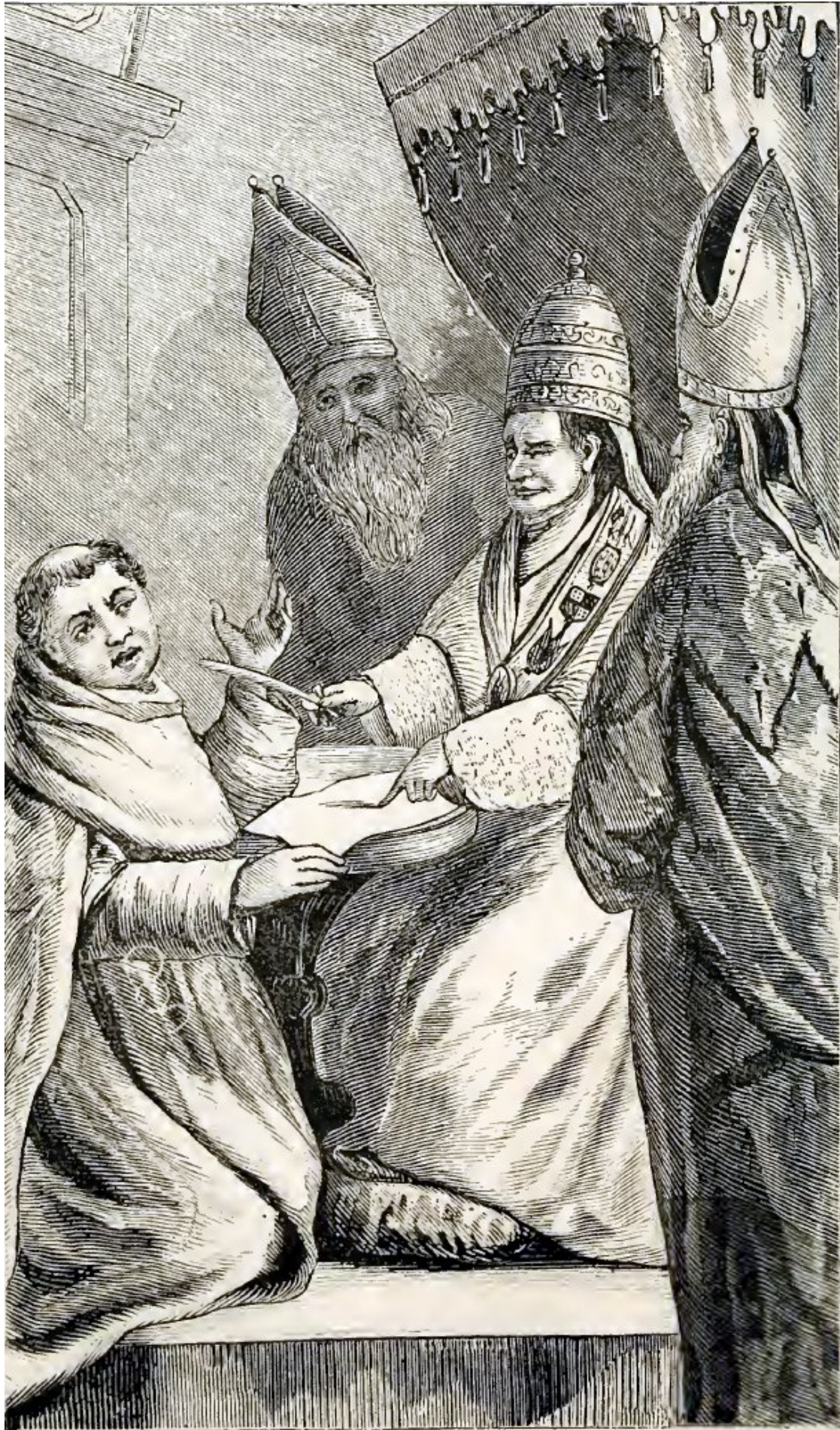
ORIENTAL PATRIARCH FORCED TO RESIGN HIS RIGHTS. Page 122.