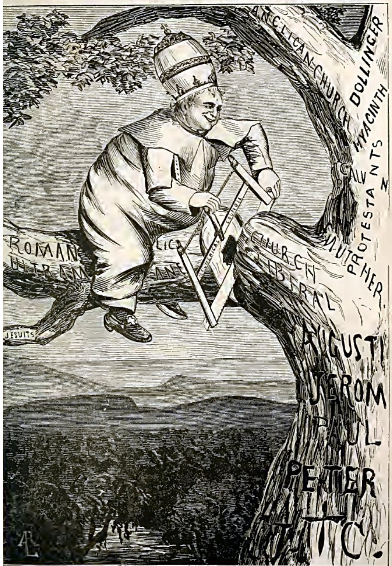
THE INFALLIBLE POPE.