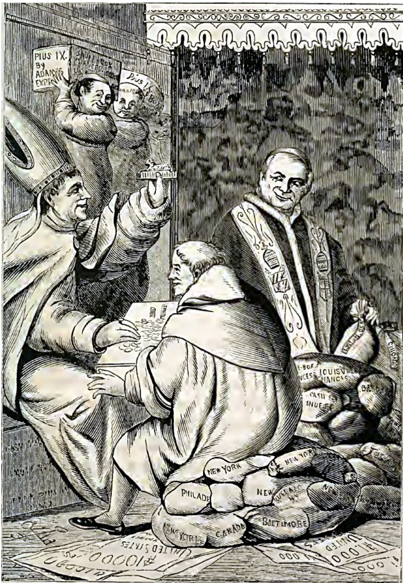
DRAWING THE CHANCES FOR THE SNUFF-BOX OF PIUS IX.