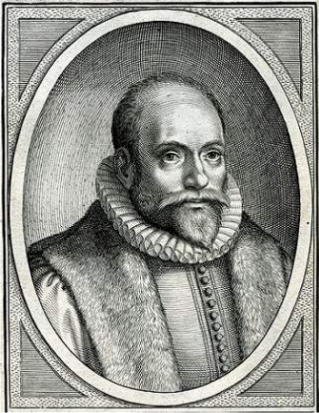
James (Jacob) Arminius

and continued his education elsewhere. He became a minister in Amsterdam and was later invited to become Professor of Divinity at the University of Leyden. It was from this point that he began propounding his theories with (guarded) vigour.