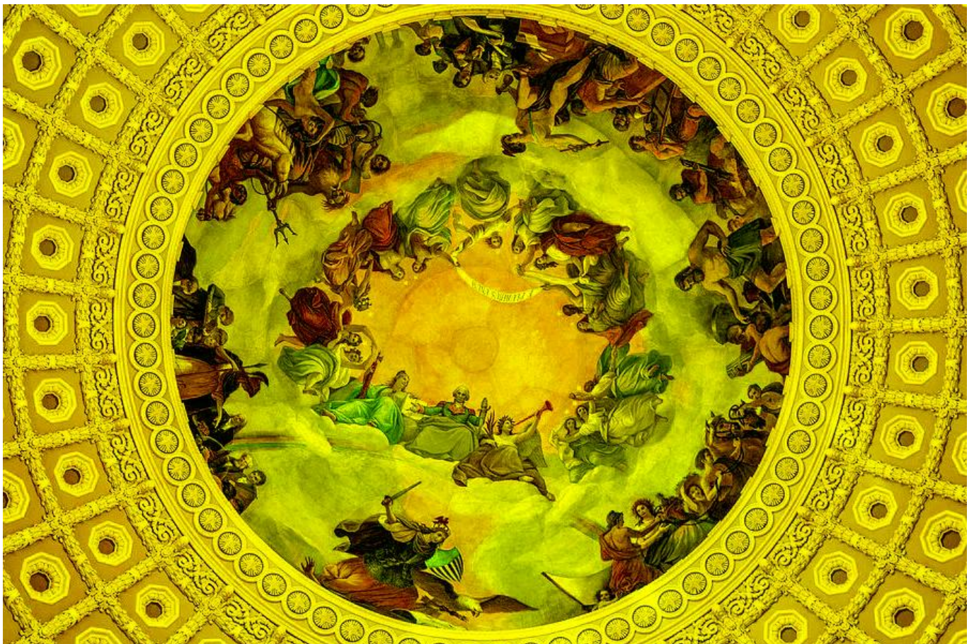
The Apotheosis of Washington is the fresco painted by Greek-Italian artist