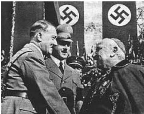
Hitler meets Pope Pius XII

I first posted this article on Aug. 26, 2009. Now because of Russia's invasion of Ukraine, I thought Christians might appreciate this message and stand against the spirit of war. The only justifiable war according to the Bible and in my opinion, is one of self-defense when an enemy attempts to invade one's nation.