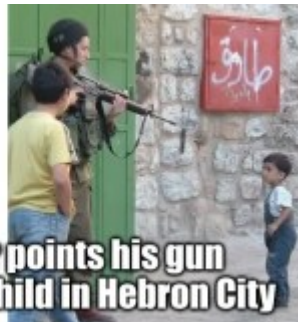
Israeli soldier points his gun at a Palestinian child in Hebron City

"And whosoever shall offend one of these little ones that believe in me, it is better for him that a millstone were hanged about his neck, and he were cast into the sea." Jesus in Mark 9:42