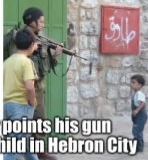
Israeli soldier points his gun at a Palestinian child in Hebron City

"And whosoever shall offend one of these little ones that believe in me, it is better for him that a millstone were hanged about his neck, and he were cast into the sea." Jesus in Mark 9:42