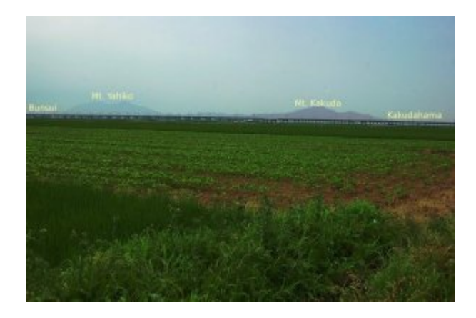
Mt. Yahiko and Mt. Kakuda from a distance of 20 kilometers.

I enjoy taking long bicycle trips from time to time. I thought it would be a good day's challenge to circle two famous mountains of Niigata, Mt. Kakuda and Mt. Yahiko, and return home before nightfall. Mt. Kakuda and Mt. Yahiko are not famous for their height. Mt. Yahiko is only 600 some meters high. They are famous for being the only mountains smack dab on the coast of the Sea of Japan in the midst of the flat rice fields that Niigata is famous for. Click the photo to see an enlargement.