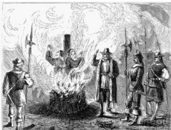
BARBON HERDED ALIVE IN FAIR.

A history of persecutions by the Horn of Daniel chapter 7, the Antichrist, the Popes of Rome who killed Bible believing Christians over the centuries till today!