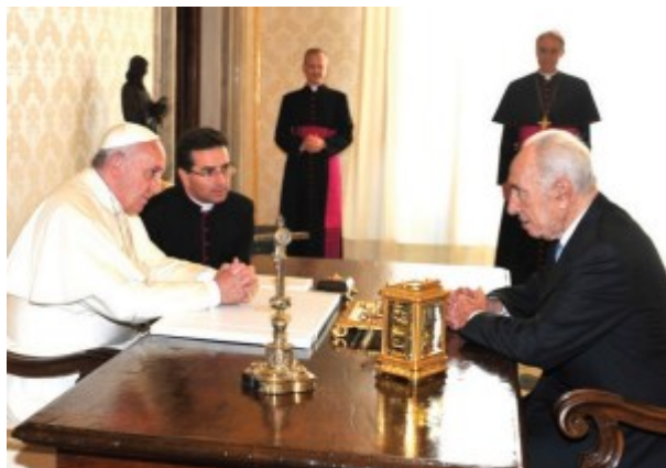
Shimon Peres with Pope Francis

This was taken from "Endtime Magazine" an e-book my friend sent me. The emphasis in bold are mine.