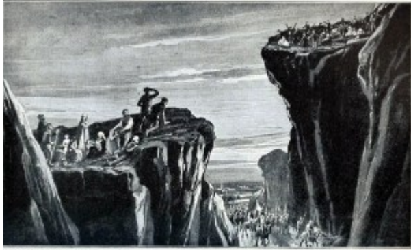
WALDENSES HUNTED BY THE ARMIES OF ROME

"Deserted, affrighted, wounded . . . they wandered in deserts, and in mountains, and in dens and caves of the earth." Heb. 11:21, 22.