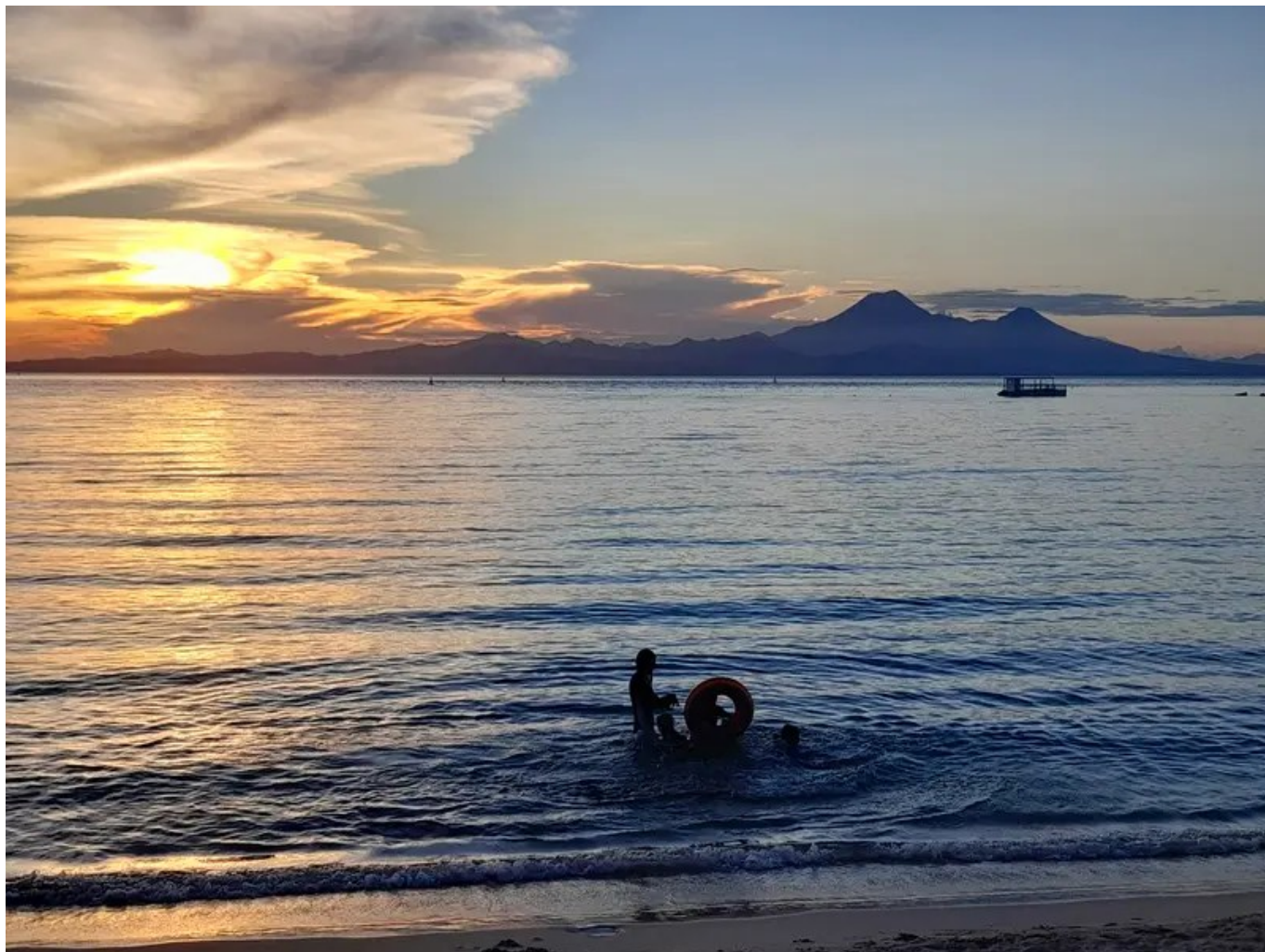
Caba Beach near sunset