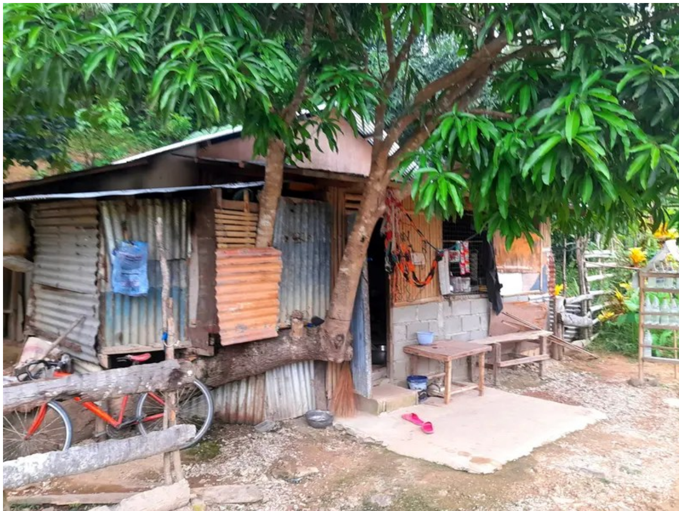
A poor family's house