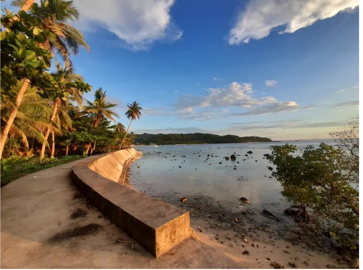
Near Caba Beach