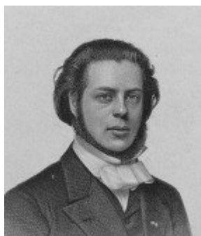
Henry Grattan Guinness – (11