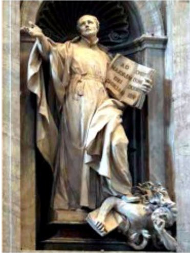
Statue in St. Peter's Basilica of Ignatius of Loyola, the founder of the Jesuit Order. His foot is on a Protestant Christian holding a Bible.