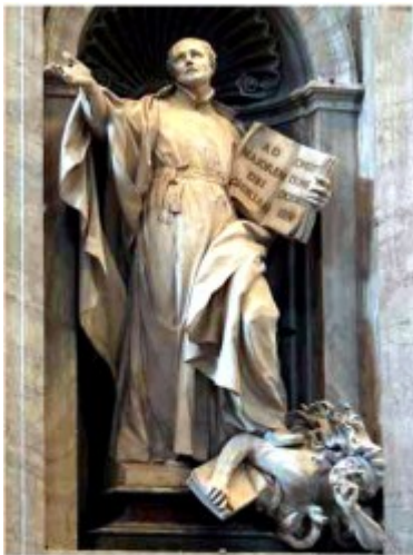
Statue in St. Peter's Basilica of Ignatius of Loyola, the founder of the Jesuit Order. His foot is on a Protestant Christian holding a Bible.