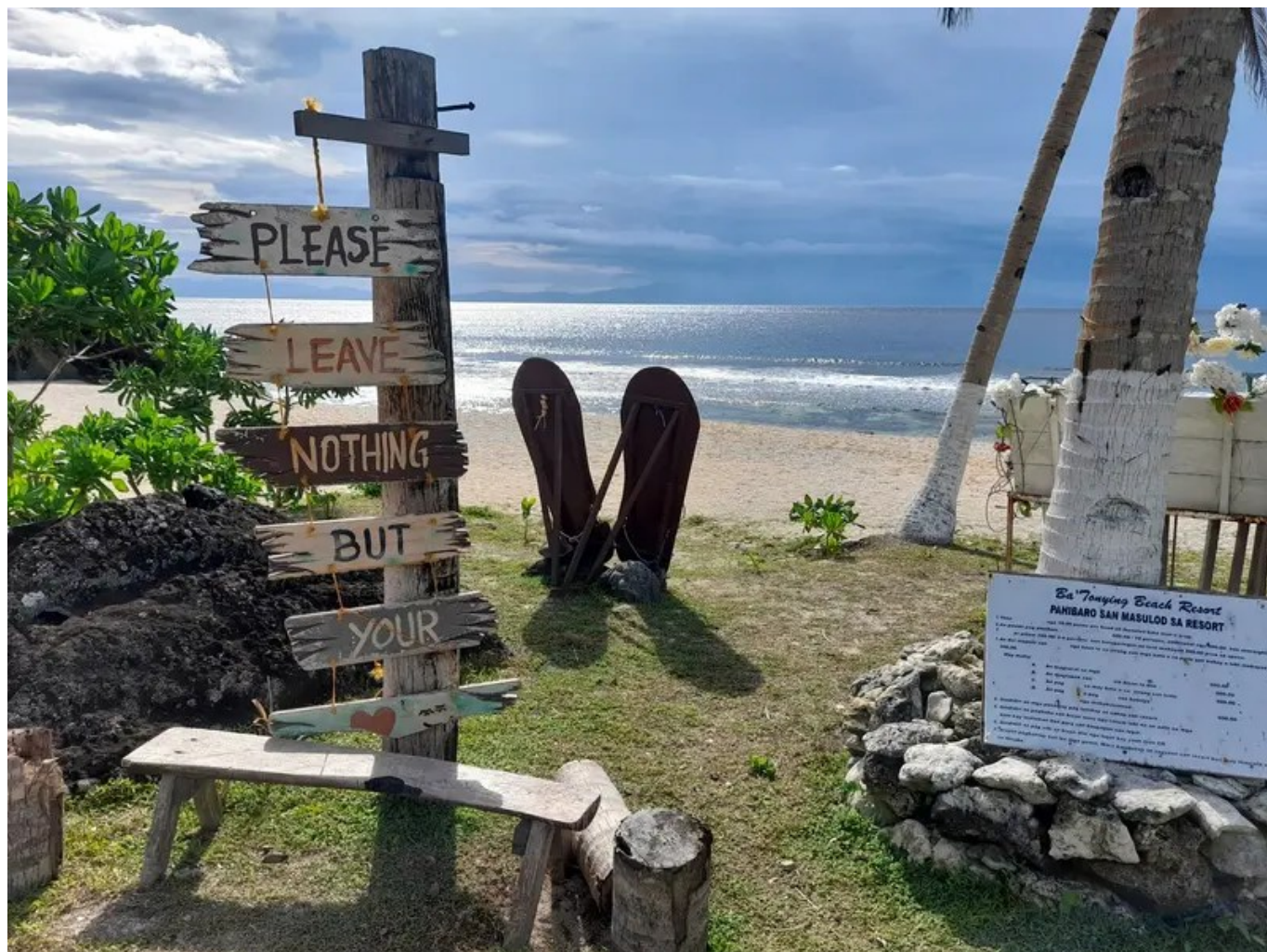
Imaga White Sand Beach sign.