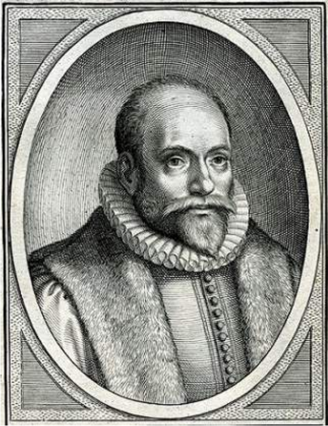
James (Jacob) Arminius

As the doctrines of free grace were in the ascendancy at the time, his teachings on free will were bound to arouse controversy and bring him into conflict with the ecclesiastical authorities. This was a dangerous activity, as heresy could be a capital offence. Perhaps because of this Arminius was difficult to pin down. His teachings could be very ambiguous and sophisticated. In 1605, for example, the Synod set nine simple questions for Arminius to answer in an attempt to clarify his position. He responded with nine opposite questions and employed scholarly and philosophical devices to avoid giving simple, straight answers. The first question was, "Which is first, Election, or Faith Truly Foreseen, so that God elected his people according to faith foreseen?" Arminius did not—perhaps dared not—give a straight answer. And so the controversy rumbled on even until after his death in 1609.