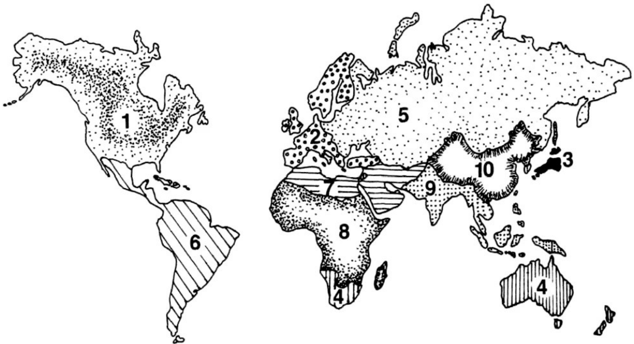
Ten Kingdoms . . . from: THE CLUB OF ROME

I believe these 10 regions may very well be the 10 horns / crowns of the books of Daniel and Revelation!