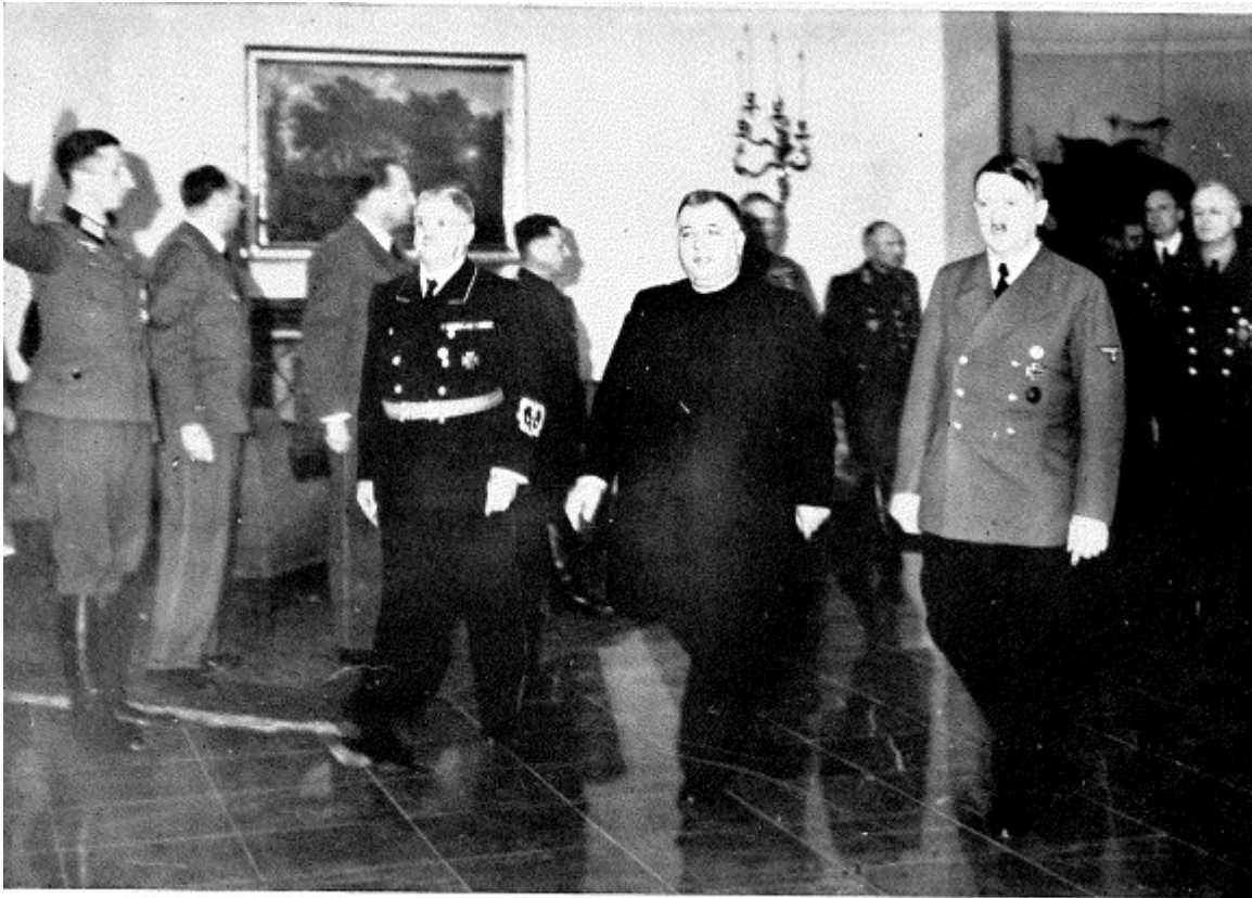
Mgr. Tiso, Head of the Slovak State, as Hitler's guest.