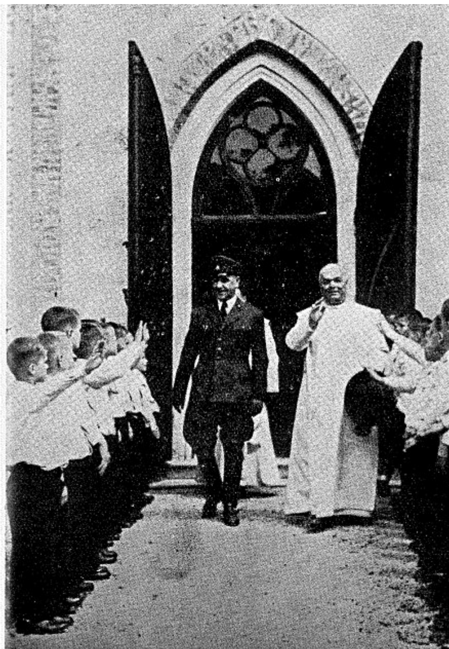
The pontifical legate Marcone and Pavelitch receive the Nazi Salute from a group of young Ustasis.