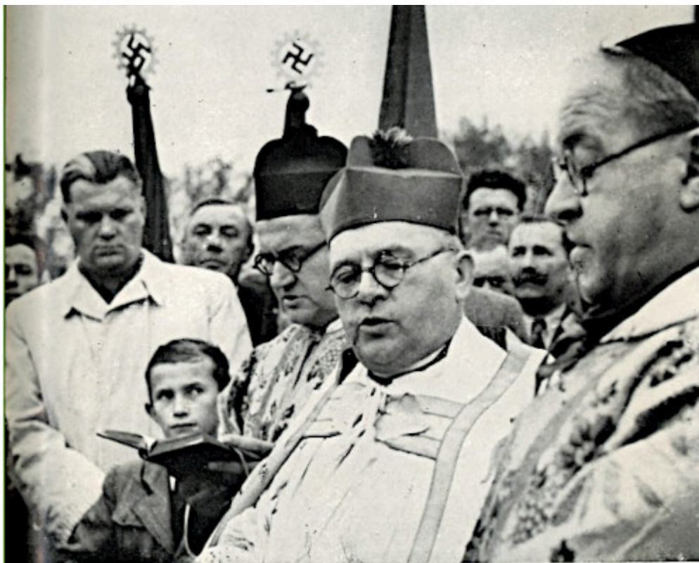
Blessing the Swastika flags.