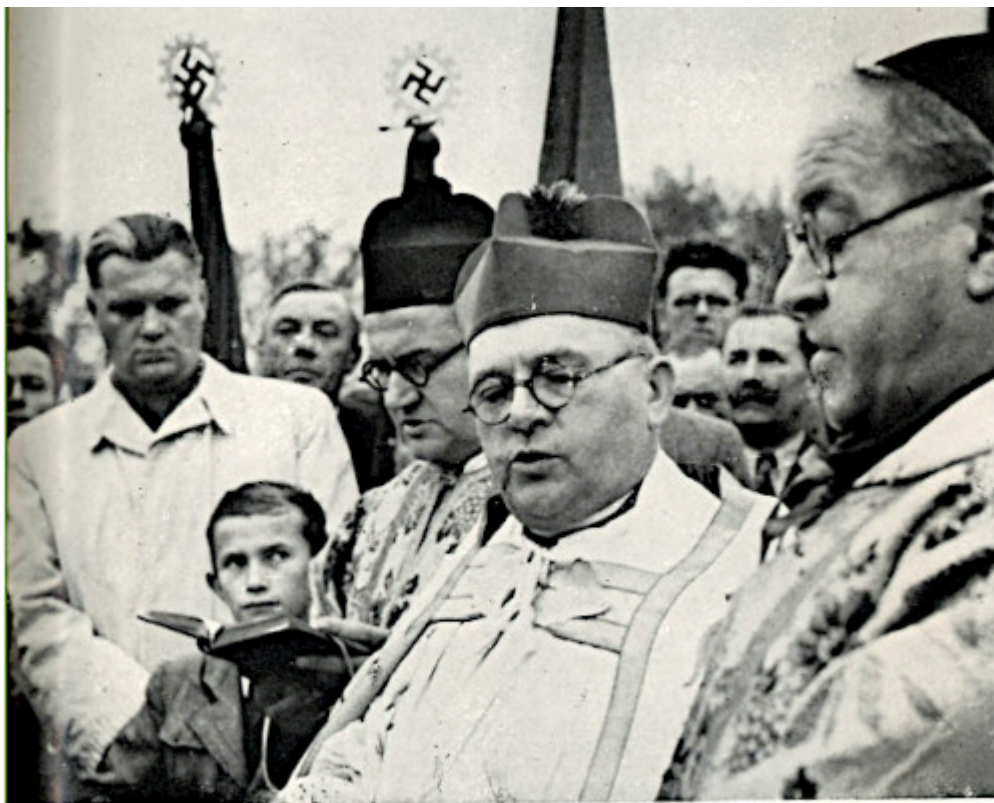
Blessing the Swastika flags.