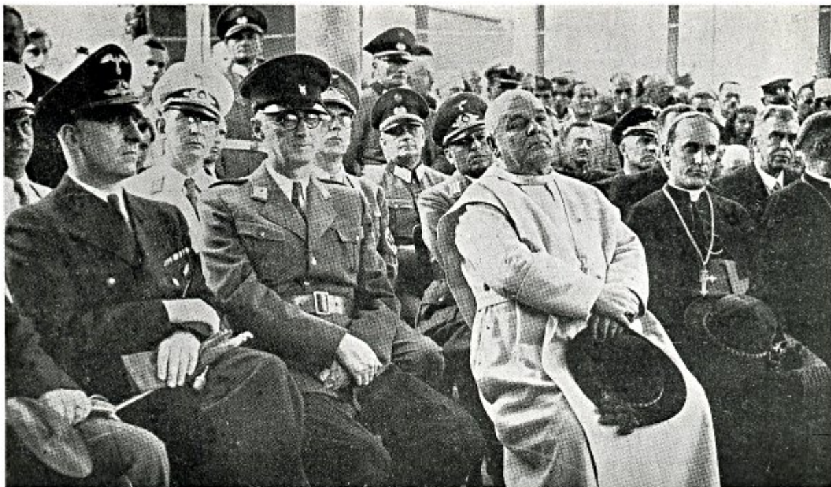
Archbishop Stepinac and the pontifical legate Marcone attending a military parade in Zagreb, surrounded by Italian, German and Ustashi officers.