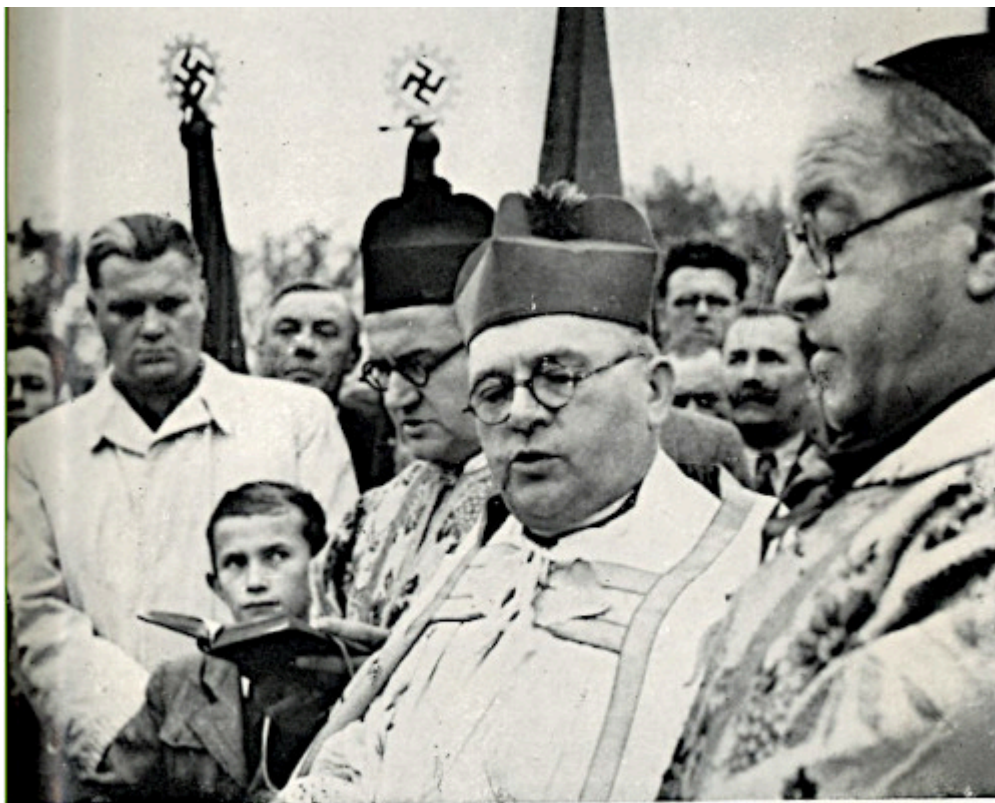
Blessing the Swastika flags.