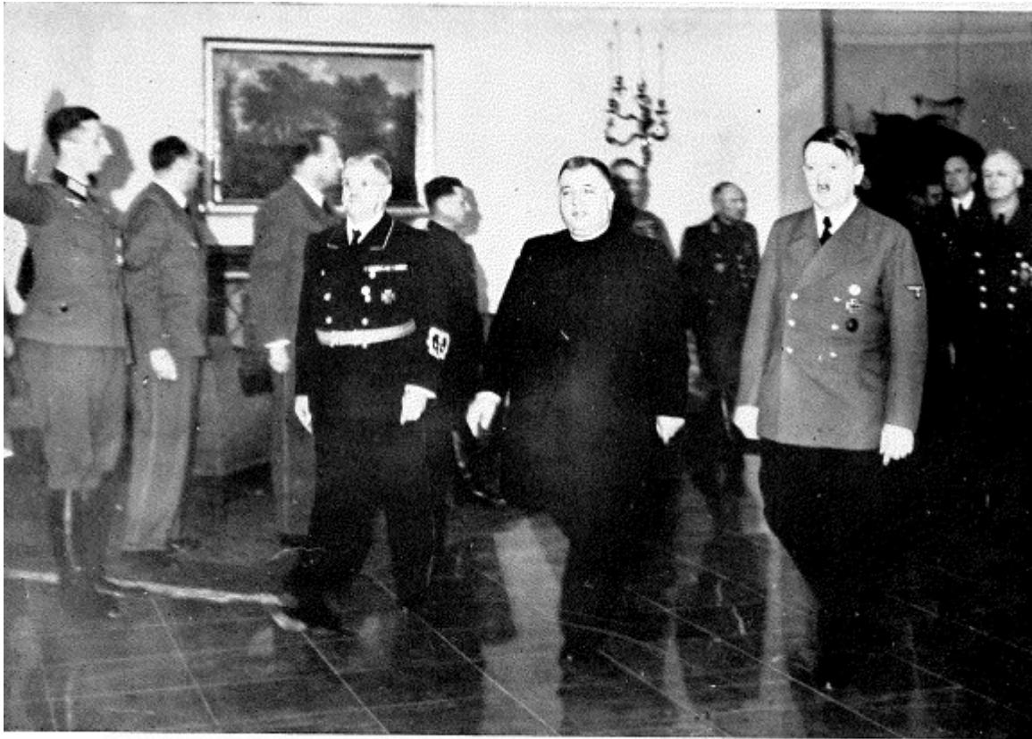
Mgr. Tiso, Head of the Slovak State, as Hitler's guest.