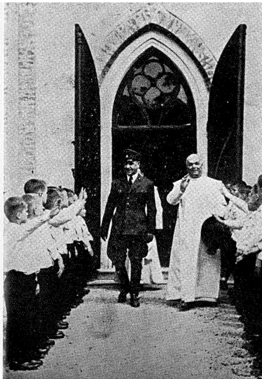
The pontifical legate Marcone and Pavelitch receive the Nazi Salute from a group of young Ustashis.