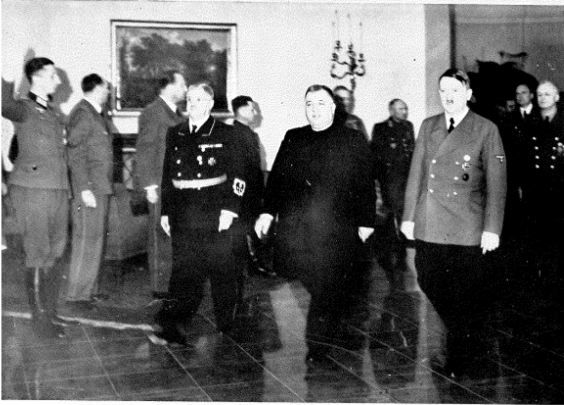
Mgr. Tiso, Head of the Slovak State, as Hitler's guest.