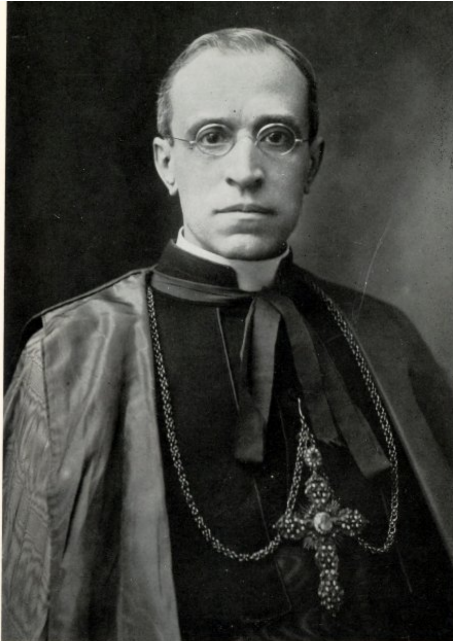
Cardinal Eugenio Pacelli, Secretary of State of the Vatican, who later became Pope Pius XII.