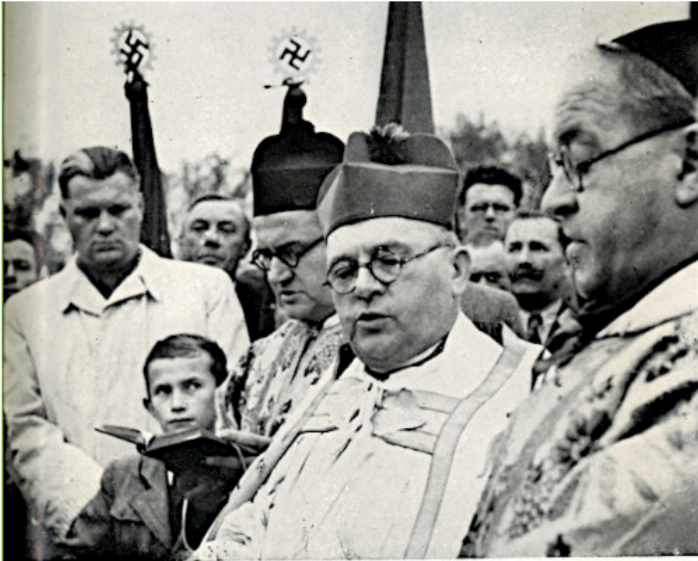
Blessing the Swastika flags.