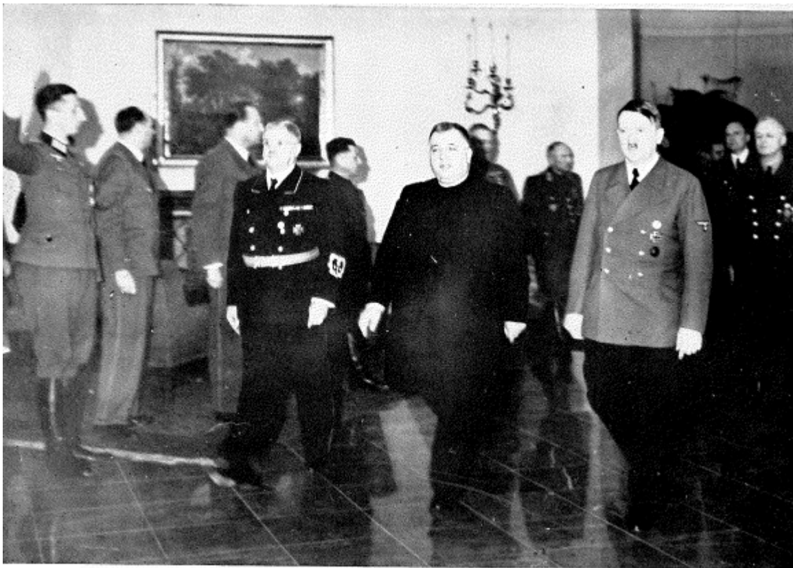
Mgr. Tiso, Head of the Slovak State, as Hitler's guest.